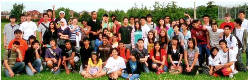
Some of the Volunteering Peel members who have given numerous hours to our community.

Working with community groups and event organizers, they provide volunteers where